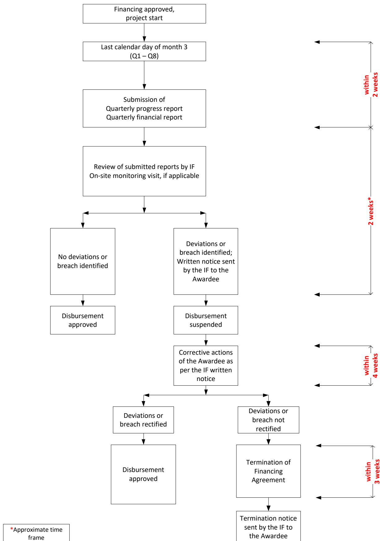
Figure 2: Monitoring procedure